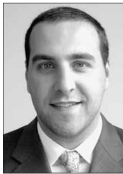
BY JARED RHOADS

The government proposes to allow covered entities to comply in one of two ways: a) offer patients a detailed accounting of all the disclosures of their PHI, or b) offer patients a shorter, less-detailed "access report" of disclosures. The former would list in detail the who, what, why, and when of all the times in which their health information was disclosed by one entity to another. The latter would provide information merely on who has accessed an individual's electronic PHI,