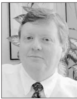
BY RUSS JONES