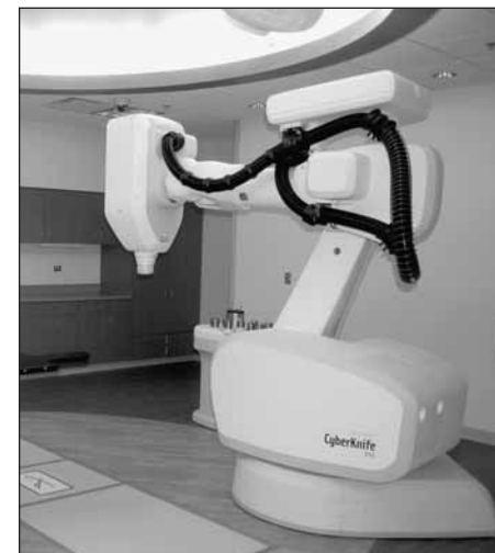
Illinois CyberKnife treatment room at Advocate Lutheran General Hospital