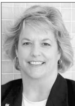
BY JEANNE KALVAITIS

"Patients often experience acute symptoms when dealing with a terminal illness," says