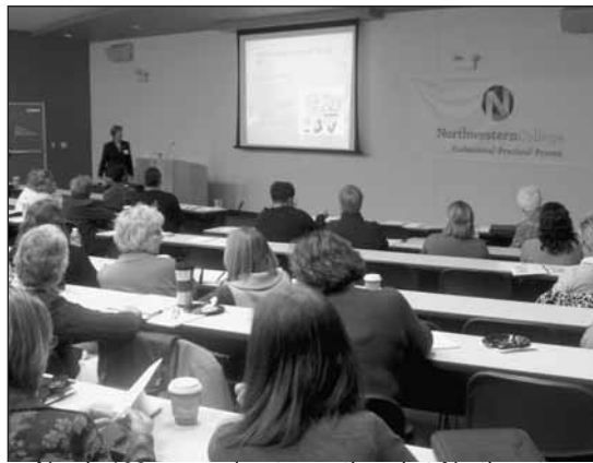
Nearly 100 nurse educators gathered at Northwestern College's Bridgeview Campus for an all-day ATI Nursing Education Educator Enrichment Conference (EEC).

Northwestern College's Violet Schumacher School of Nursing in Bridgeview was the host for ATI Nursing Education's Educator Enrichment Conference (EEC) for nurse educators. Nearly 100 nurse educators attended this free EEC at Northwestern College's Bridgeview Campus Auditorium which featured nursing professionals who provided practical and education-based information for immediate use by educators in their classrooms. ATI is primarily known for providing educational testing and simulations which assist those preparing to be nurses to successfully complete the National Council Licensure Examination (NCLEX) for registered nurses. However, these newly instituted Educator Enrichment Conferences were launched by ATI in order to provide support and assistance for nursing educators, with all those who attended last week's conference receiving Continuing Education (CE) credits for their participation.