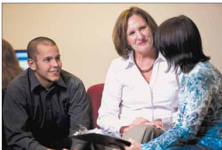
Lewis University professors give personal attention to professional nurses pursuing graduate studies and advancing their careers.